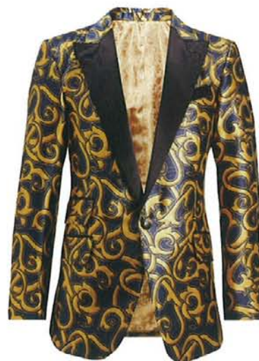
Jacket made with Swarovski Elements by Billionaire Italian Couture at Harrods, £5,300 (020 7730 1234)