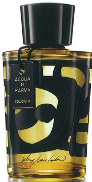
Colonia Scacchetti limited edition Eau de Cologne by Acqua di Parma at Harrods, £104 for 180ml (020 7730 1234)