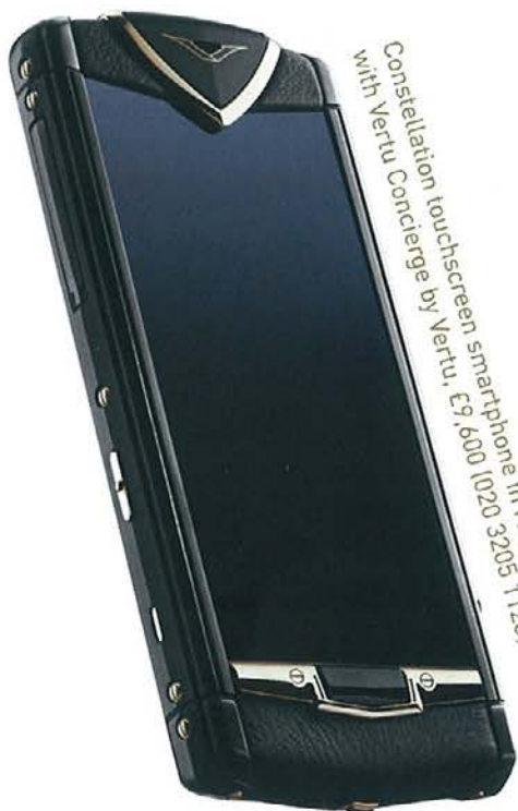
Constellation touch screen smartphone in rose gold with Vertu Concierge by Vertu, £9,000 (020 3203 1123)