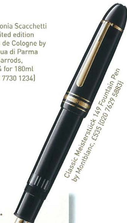
Classic Meisterstück 149 Fountain Pen by Montblanc, £535 (020 7629 5883)